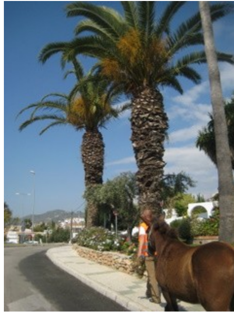
¡Beep beep! Mind your backs please mule coming through

We passed by plenty of curious onlookers as we passed Capistrano, the health centre, the police station, the bus station and finally over the river to the safety of the sanctuary.