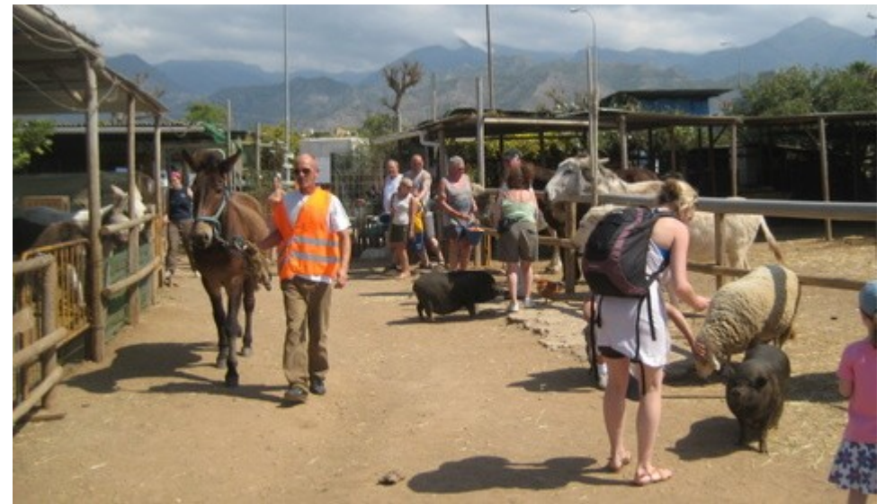
Safe at last