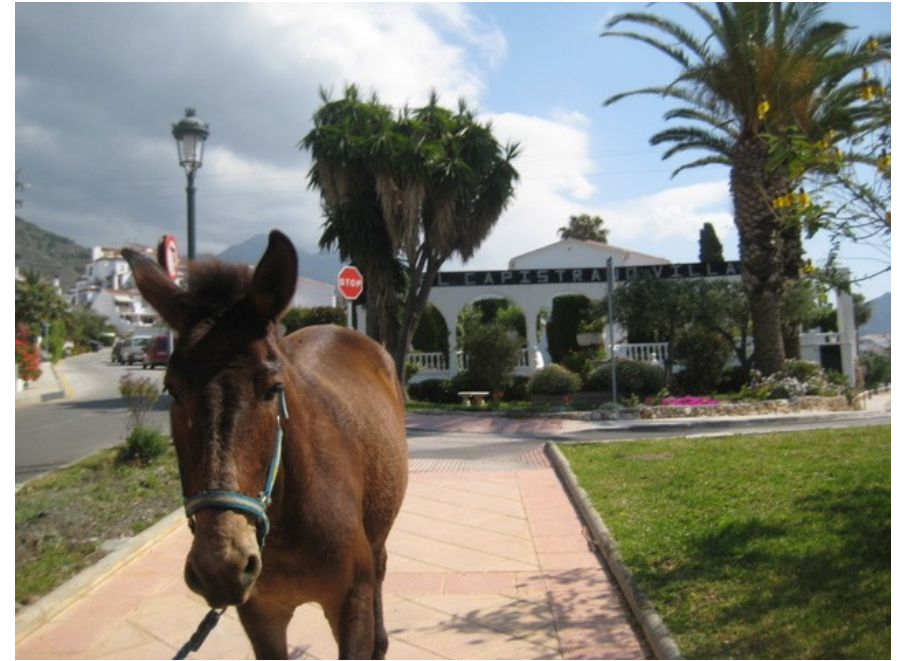
Passing the entrance to Capistrano Village, Nerja

It turned out he was very upset having lost his mule that he had had since it was born. He was soon reunited with his mule and left the sanctuary a happy man all be it with a warning to tie the animal up better.