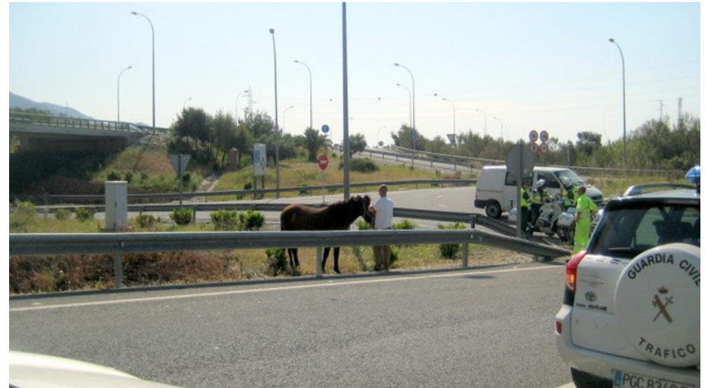
While they were away two Trafico officers turned up and a man from the highways agency so all in all about 10 officers for one mule.

We waited with the police for the animal unit SEPRONA to turn up with their chip scanner but after half an hour waiting the local police got fed up so drove back to the Nerja police station to get their scanner.